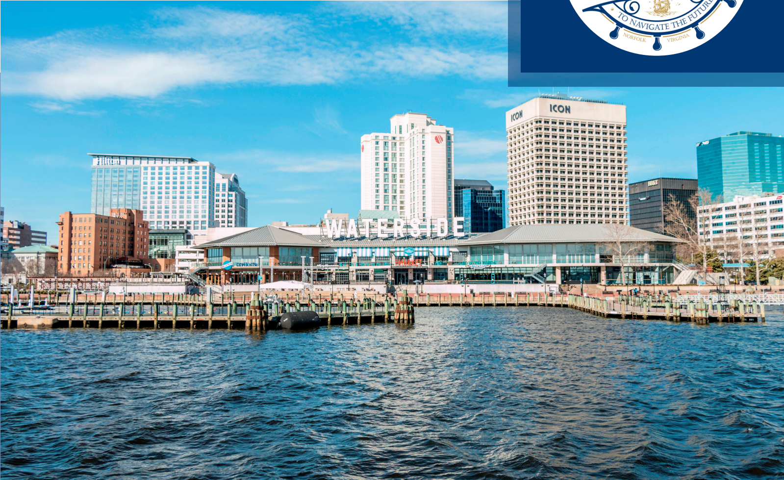
EXHIBIT HALL | MONDAY, SEPTEMBER 16, 2024